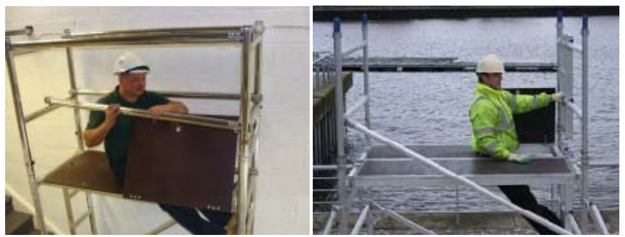
Figure 1 "Seated" Position