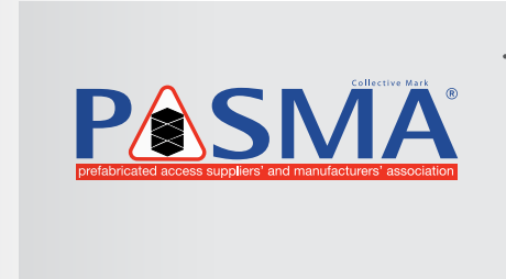
Light Grey C0 M0 Y0 K10 | R230 G230 B230

Below are some examples of which logo version should be used on the selected background colours.