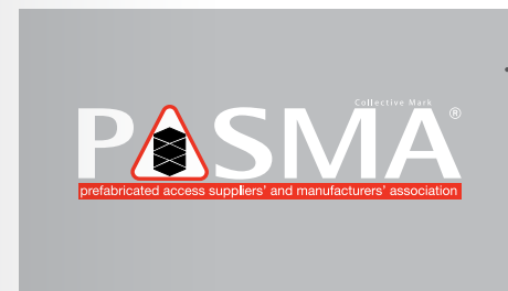
Grey C0 M0 Y0 K30 | R190 G190 B190