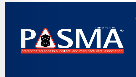
Navy C100 M80 Y0 K45 | R0 G46 B110